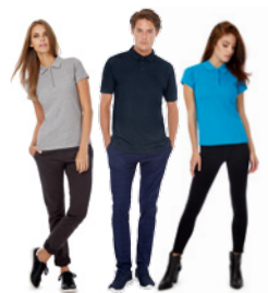
B&C Safran, B&C Safran Pure /women & B&C Safran Timeless /w.